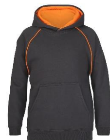
Winter Fleecy Hoodie