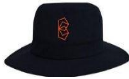
Broad Brim Hat