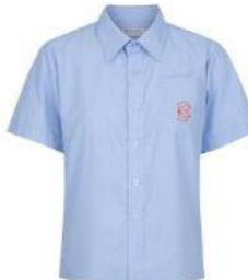
Short sleeve Shirt