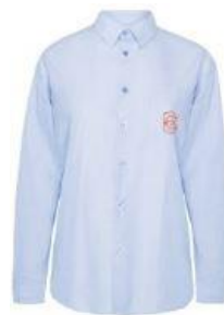
Long sleeve Shirt