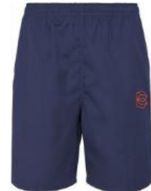
Pull on elastic waist shorts