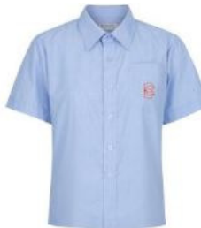
Short sleeve Shirt