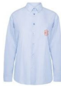
Long sleeve Shirt