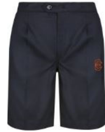
Fly Front Shorts