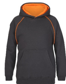
Winter Fleecy Hoodie