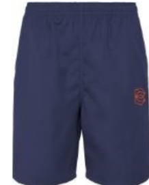
Pull on elastic waist shorts