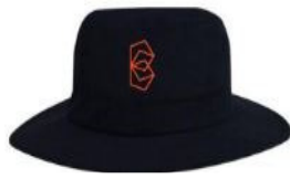
Broad Brim Hat